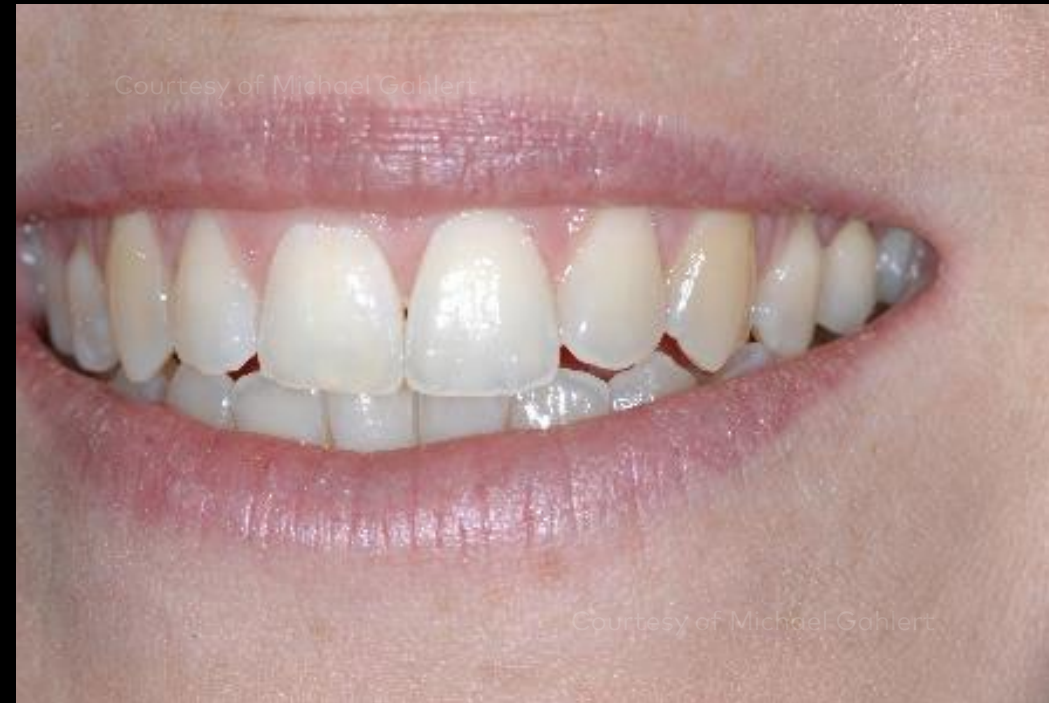
Lip line during smiling shows the natural appearance and the esthetic result at 3 months after surgery.