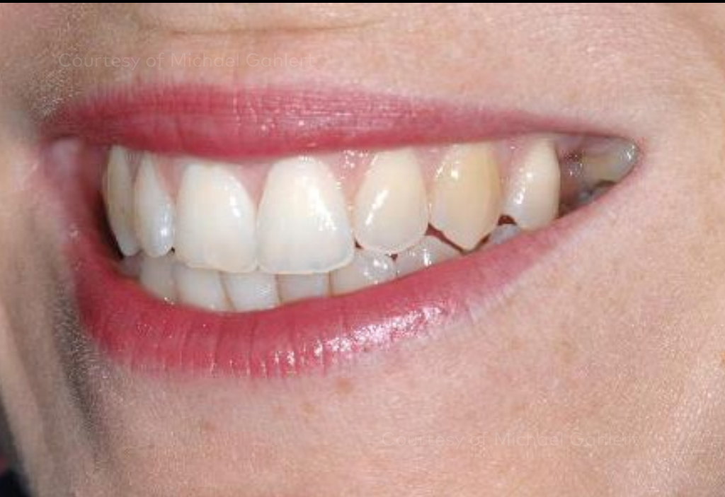
Lip line during smiling shows the tooth gap before surgery.