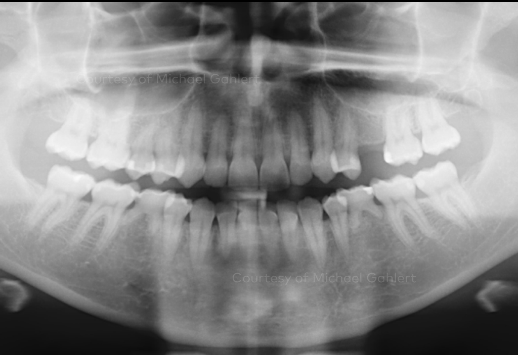
OPG before surgery.