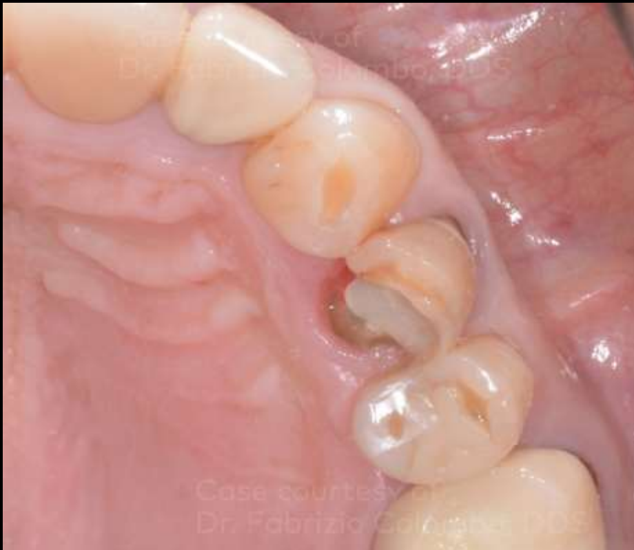
Loss of the palatal wall of the crown on 24.