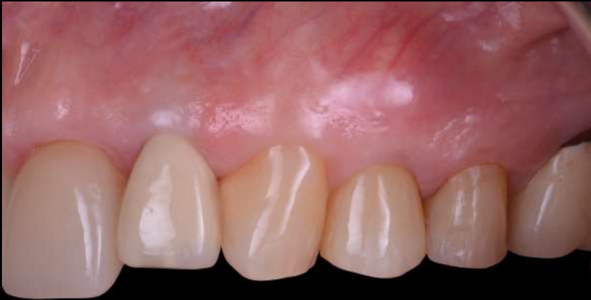
Final ceramic screwed crown (lateral view, 7 months after implant placement).