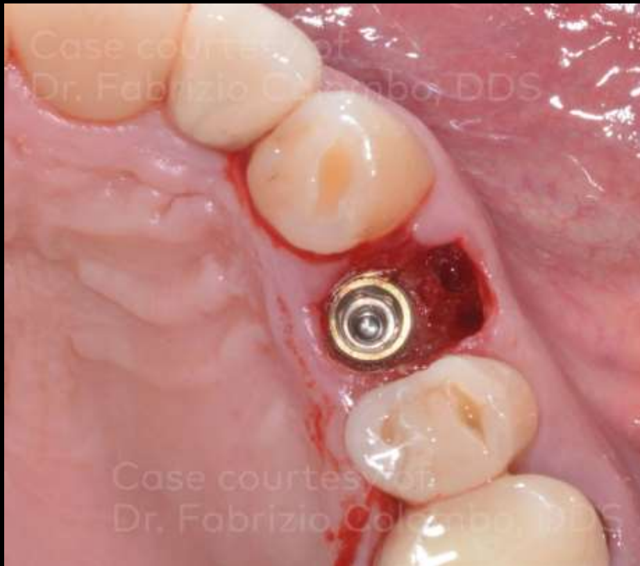
Occlusal detail of the implant placement.