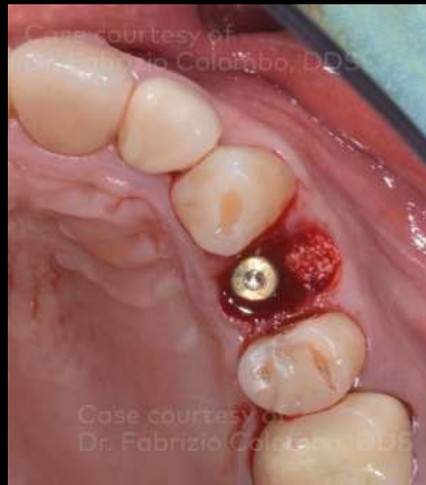
View of the biomaterial placed.