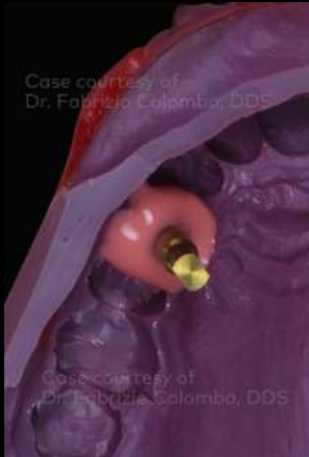
Detail of the impression (Impregum 3M ESPE).