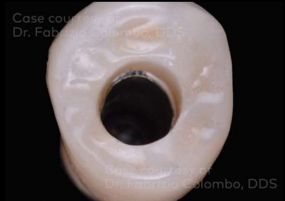
Final zirconia screwed crown (occlusal view).