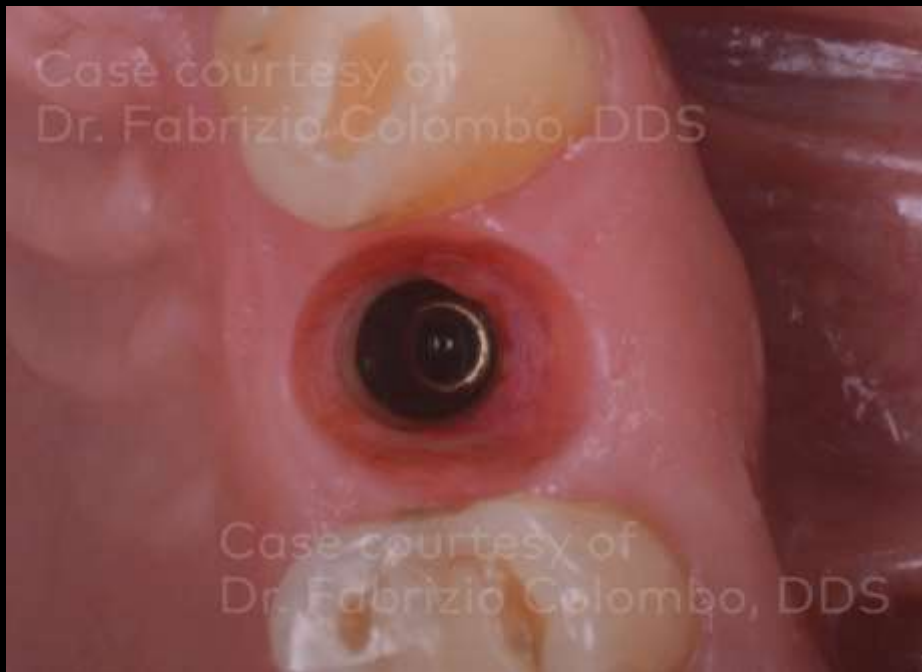
Final clinical situation of the gingival tunnel (occlusal view). Detail of the buccal convex architecture (7 months after implant placement).