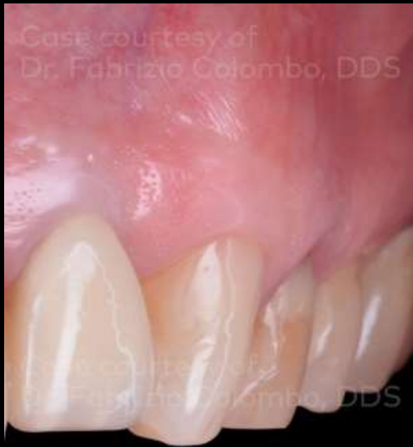
Detail of the typical buccal convex architecture in the area of 24 (frontal view).