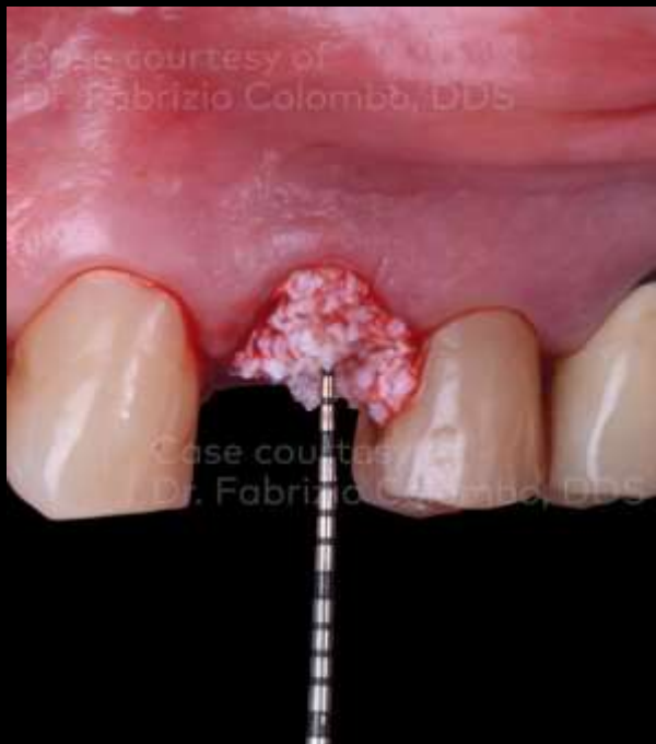
Insertion of the graft in the buccal socket.