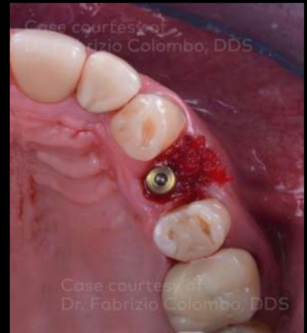
Temporary protection of the graft with fibrin sponge.