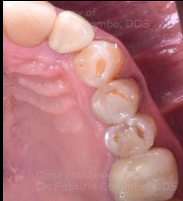
Detail of the typical buccal convex architecture in the area of 24 (occlusal view).