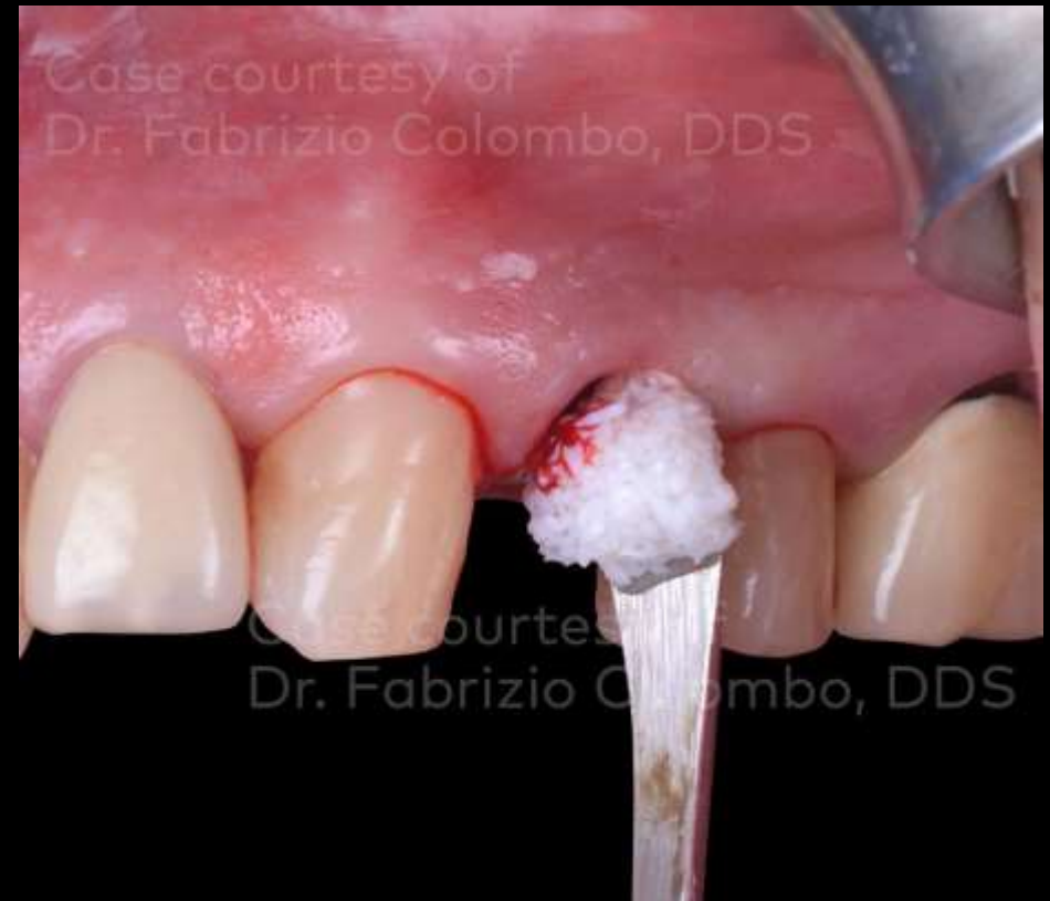
The socket is filled using creos™ xenogain 0.5 g small granules.