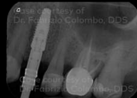
X-ray taken during the impression phase.