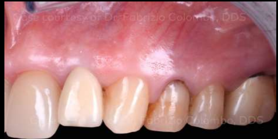
Initial clinical situation – Buccal view.