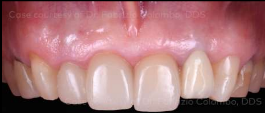
Initial clinical situation – front view.