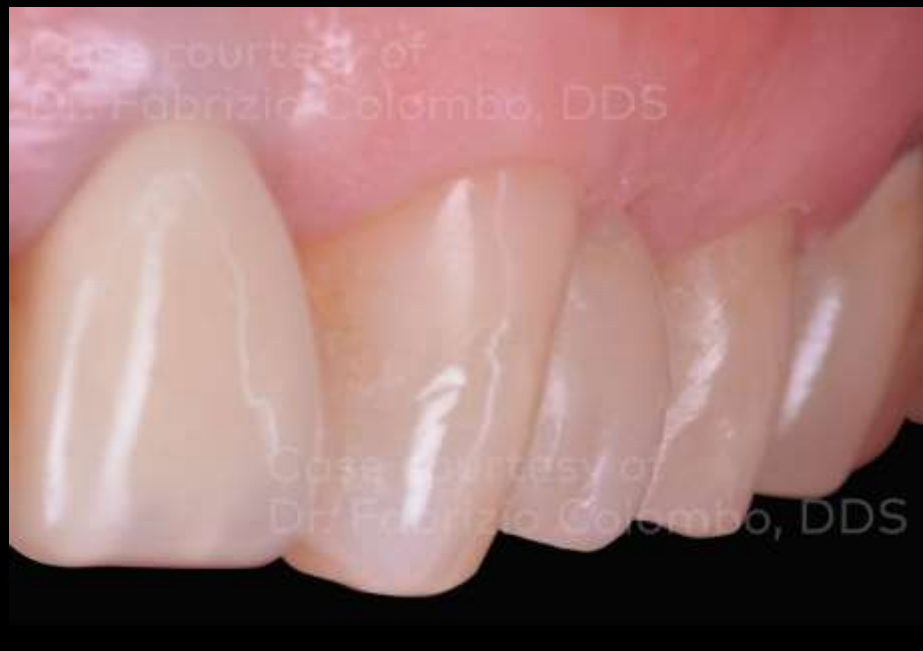
Temporary screwed crown a few days after surgical phase.