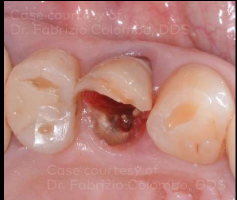
Vertical fracture on 24.