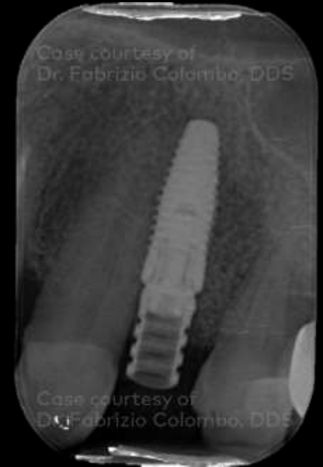
Temporary crown X-ray.